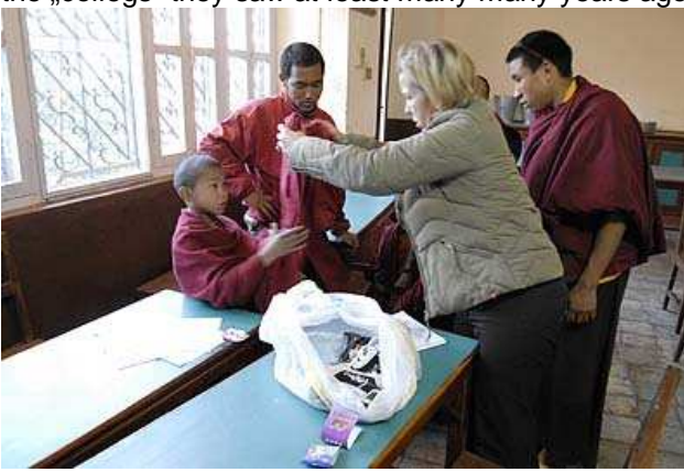
All little monks getting warm socks and underwear...