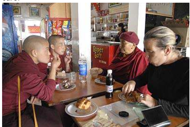
After that we invite her to coffee and cake - that was the better job.