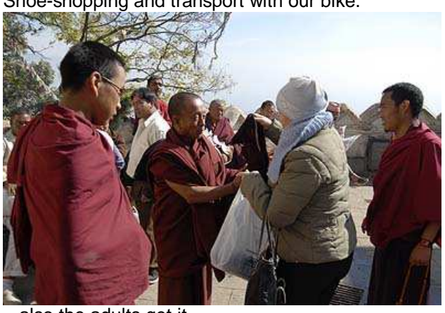
...also the adults get it.