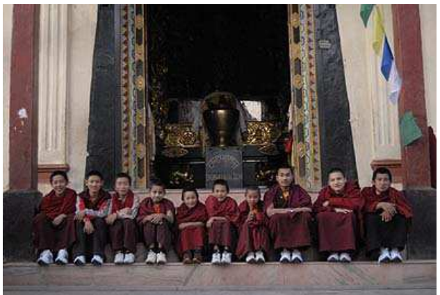
The new shoes are the hit....