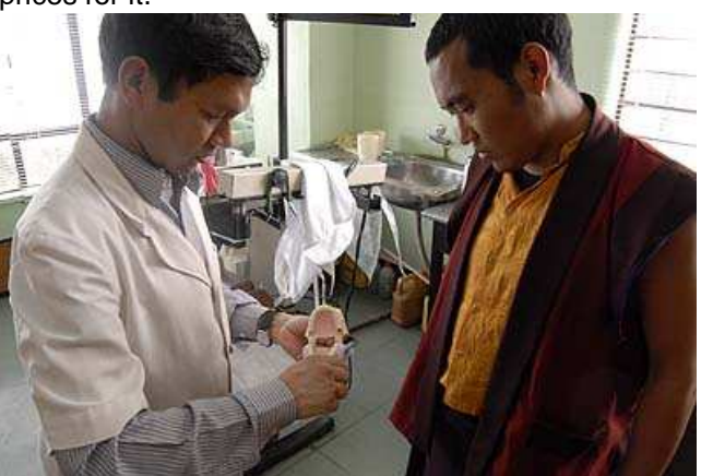
Finally the dentist assistent gives a lecture in dental care.