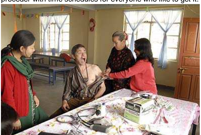
Also Peter - after him 70 monks come.