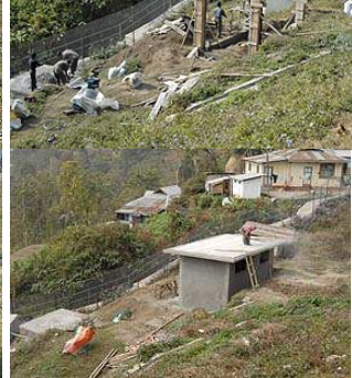
Karmapa orders to buildup a small house for the generator - meanwhile the generator is installed inside and supplies both buildings of the university.