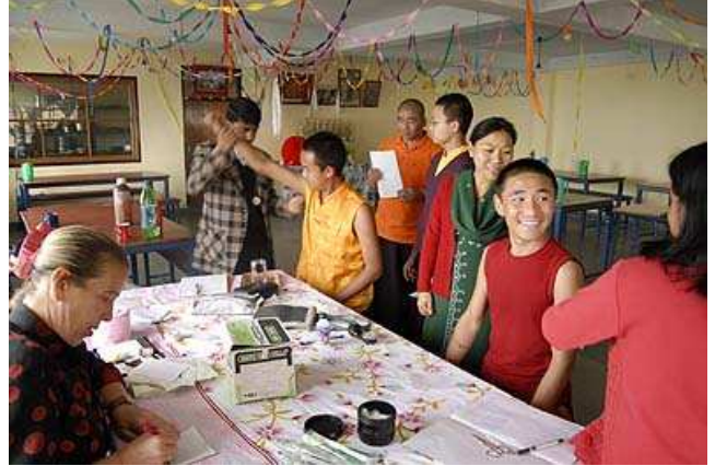
This good prepared action is finished successfully in 6 hours.