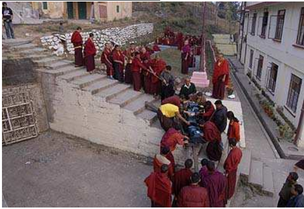
The big Mahakala-Puja starts and all monks help carrying the 350kg-device to his place.