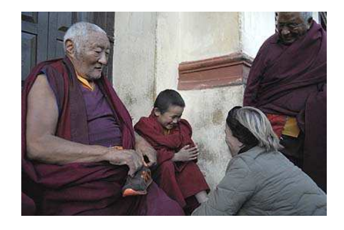
Closed tight shoes – useful prevention for wintertime.