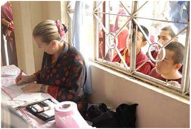
We organize a big vaccin for all monks - first we inform and give lesson in health prevention, than we order really fresh vaccin and finally we find a good doctor and fix a serious proceder with time schedules for everyone who like to get it.