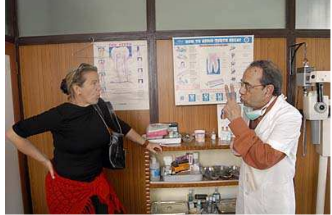
The next is to search and find a experienced dentist. From now on he will do all preventions and service about 200 monks and nuns. We bargle out good prices for it.