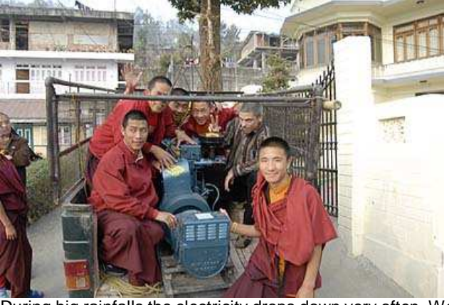
During big rainfalls the electricity drops down very often. We buy a big 7.5kW-generator - it arrives in time with starting big pujas.