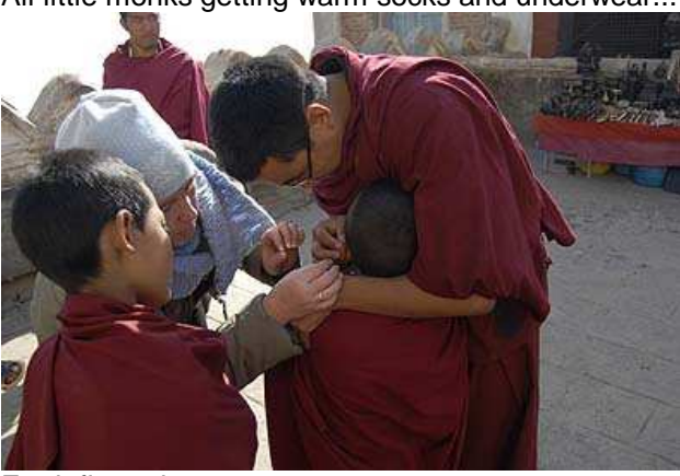
Ear inflamations are not rare.