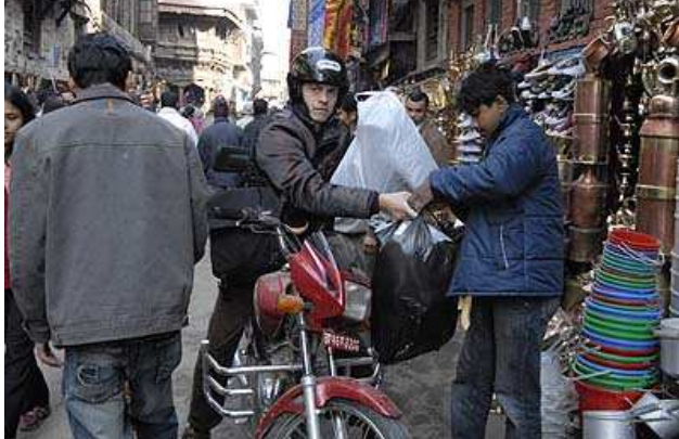
Shoe-shopping and transport with our bike.