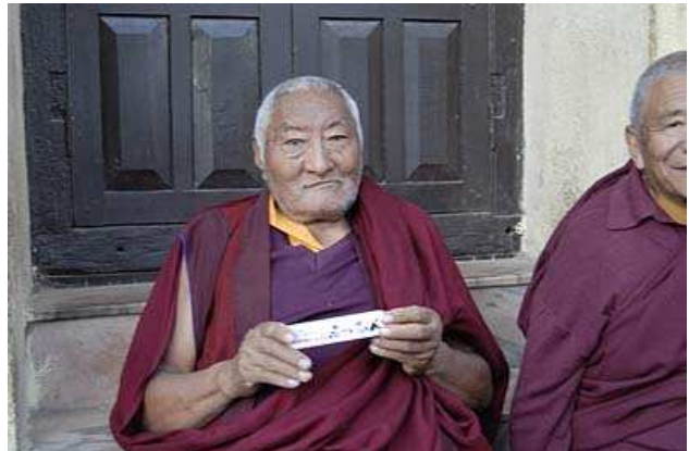
The Rheumacreme – a helpful gift for the old generation.