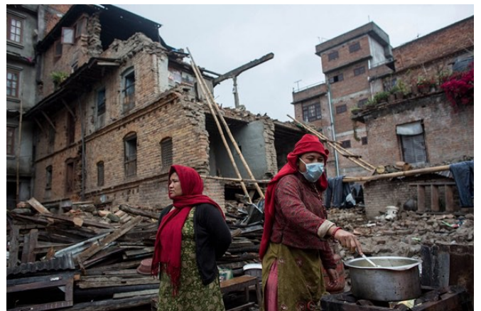
(below): Devastating Earthquake destroyed lots of Karma Kagyu Monasteries in Nepal along with some world heritage site.