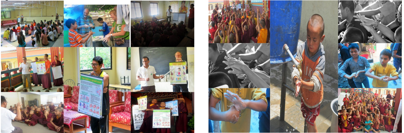
Photo above: Discussion and Interaction on water born disease and its prevention and “Hand Washing with Soap” Protection from Disease that enhanced child survival and development.