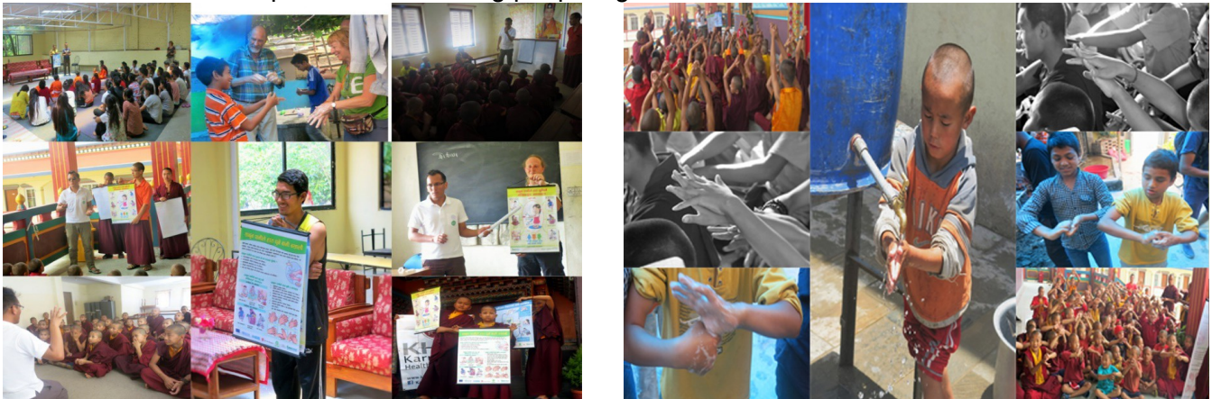
Photo above: Discussion and Interaction on water born disease and its prevention and "Hand Washing with Soap" Protection from Disease that enhanced child survival and development.